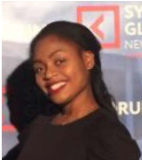
Chama Dalge 3L